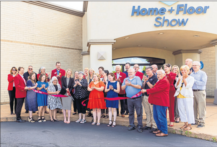
Home + Floor Show, 1475 Associates Drive.