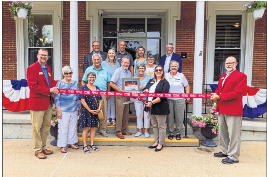
Mount Pleasant Home, 1695 Mount Pleasant St.