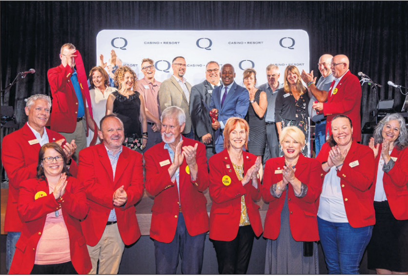
Dubuque Area Chamber of Commerce Q Casino + Resort, 1855 Greyhound Park Road.