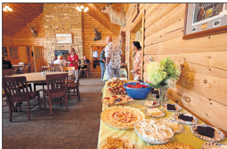
The Business After Hours was hosted by Dubuque Area Landlords Association.