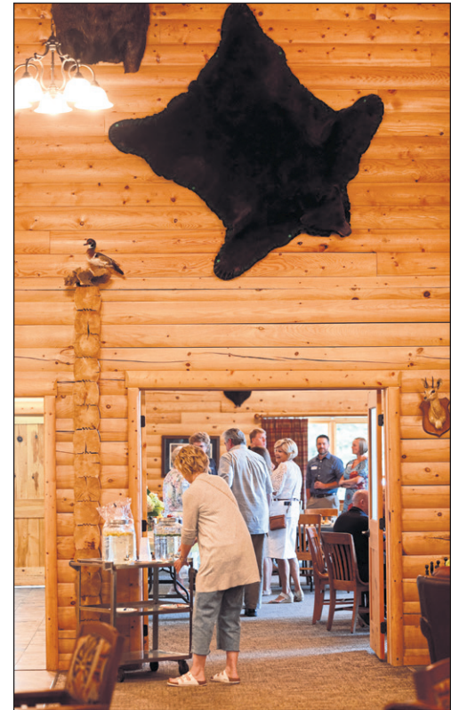
Attendees mingle during Business After Hours.