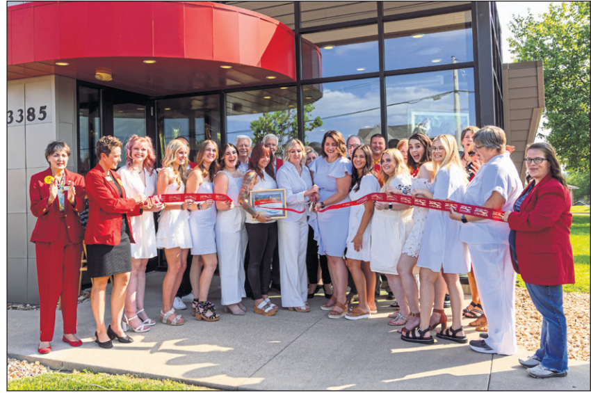
DesignWorks, 3385 Asbury Road.